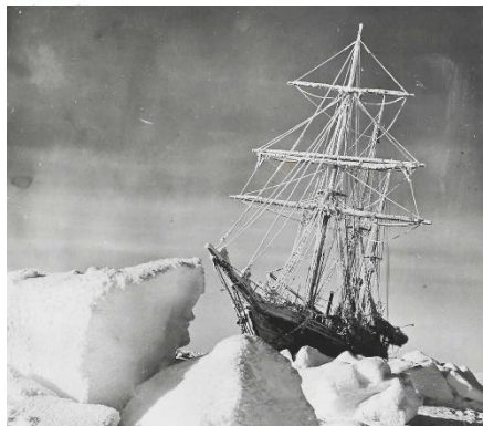
Shackleton's ship, Endurance, was lost to the ice in 1915.

The indigenous peoples of the Arctic have inhabited the area for thousands of years. In the past, they adapted to the cold, harsh conditions by hunting and eating animals native to the area, such as seals, whales and walrus, and using reindeer skins to keep warm. Many lived nomadic lifestyles, following reindeer herds. Today, many indigenous peoples live in permanent settlements and have a modern lifestyle, but some still follow the traditional way of life.