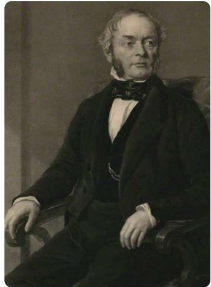
Samuel Wilderspin (1791-1866)

Samuel Wilderspin was a teacher who is known as the founder of infant education. He had enjoyed learning at home and looked forward to going to school. When he started school he didn't like the strict teachers or the boring lessons. He believed that children should enjoy school and be happy. He invented the school playground so children could play outside.